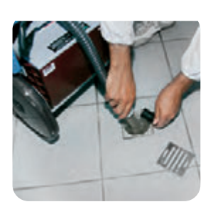
Easy cleaning of the recovery tank through its practical discharge hose