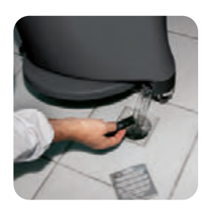
Cleaning of the solution tank filter

USER-FRIEDLY! During EXTRAORDINARY maintenance procedures!