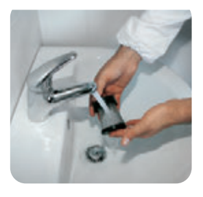
Simple and practical thorough cleaning of the suction filter