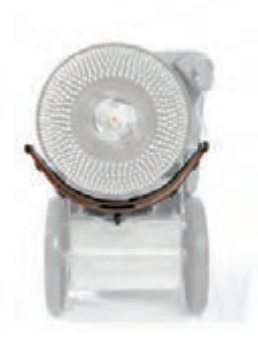
Parabolic squeegee at rest