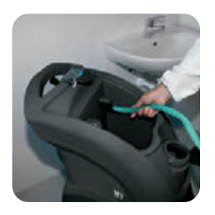
Periodic cleaning of the squeegee hose to ensure efficient suction