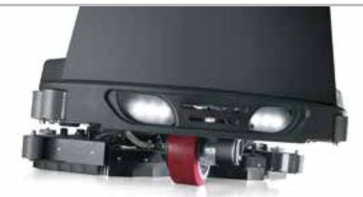
SMg are equipped with new generation motorwheel that allows to clean at high speed and in total safety thanks to antiskid wheel