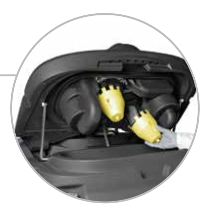
The double vacuum motor ensures excellent cleaning results also on uneven surfaces. Filters proper cleaning keeps constant vacuum performances